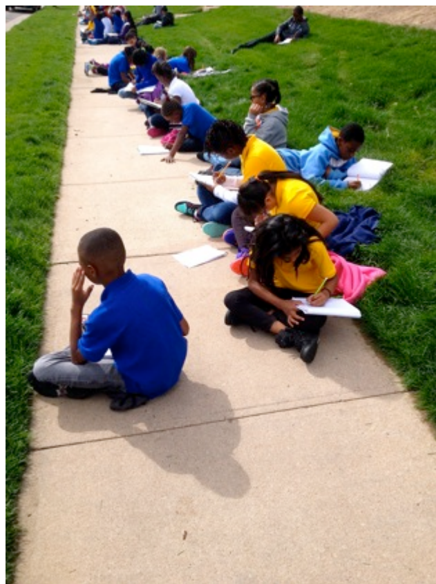
Students walked to the site and envisioned what they hope it will be like.